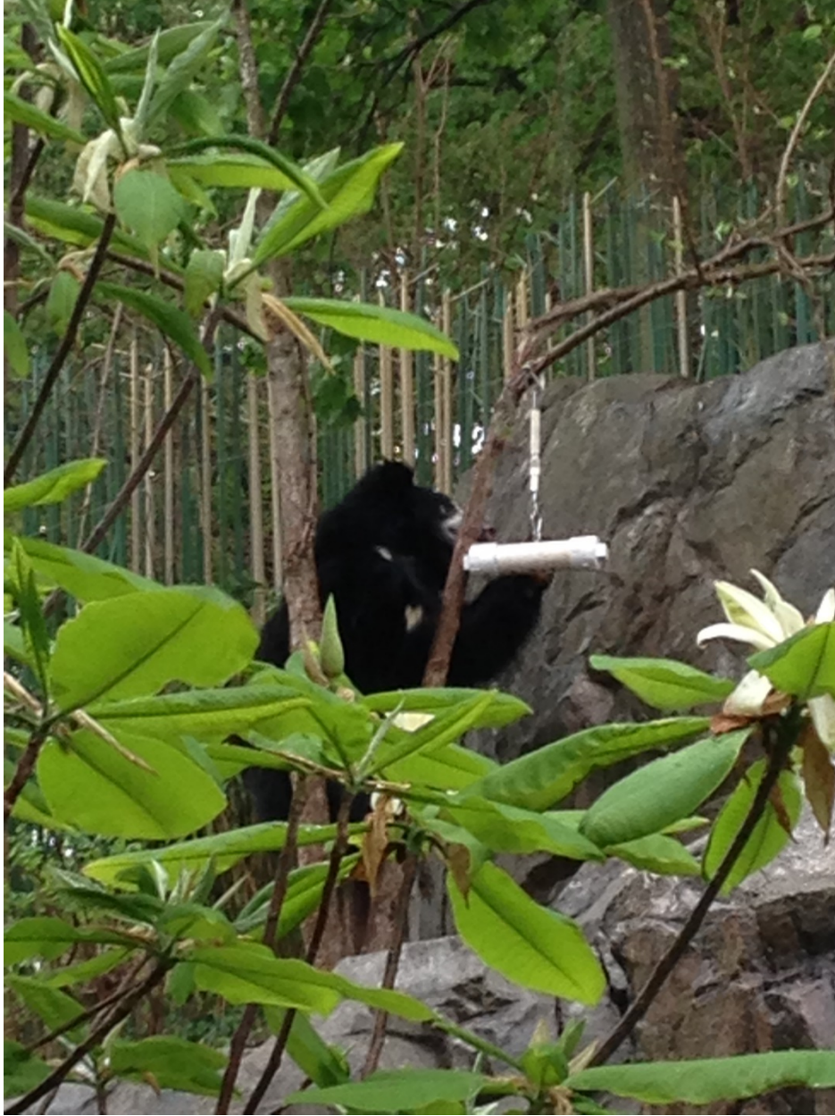
Puzzle feeder hanging from tree branch.