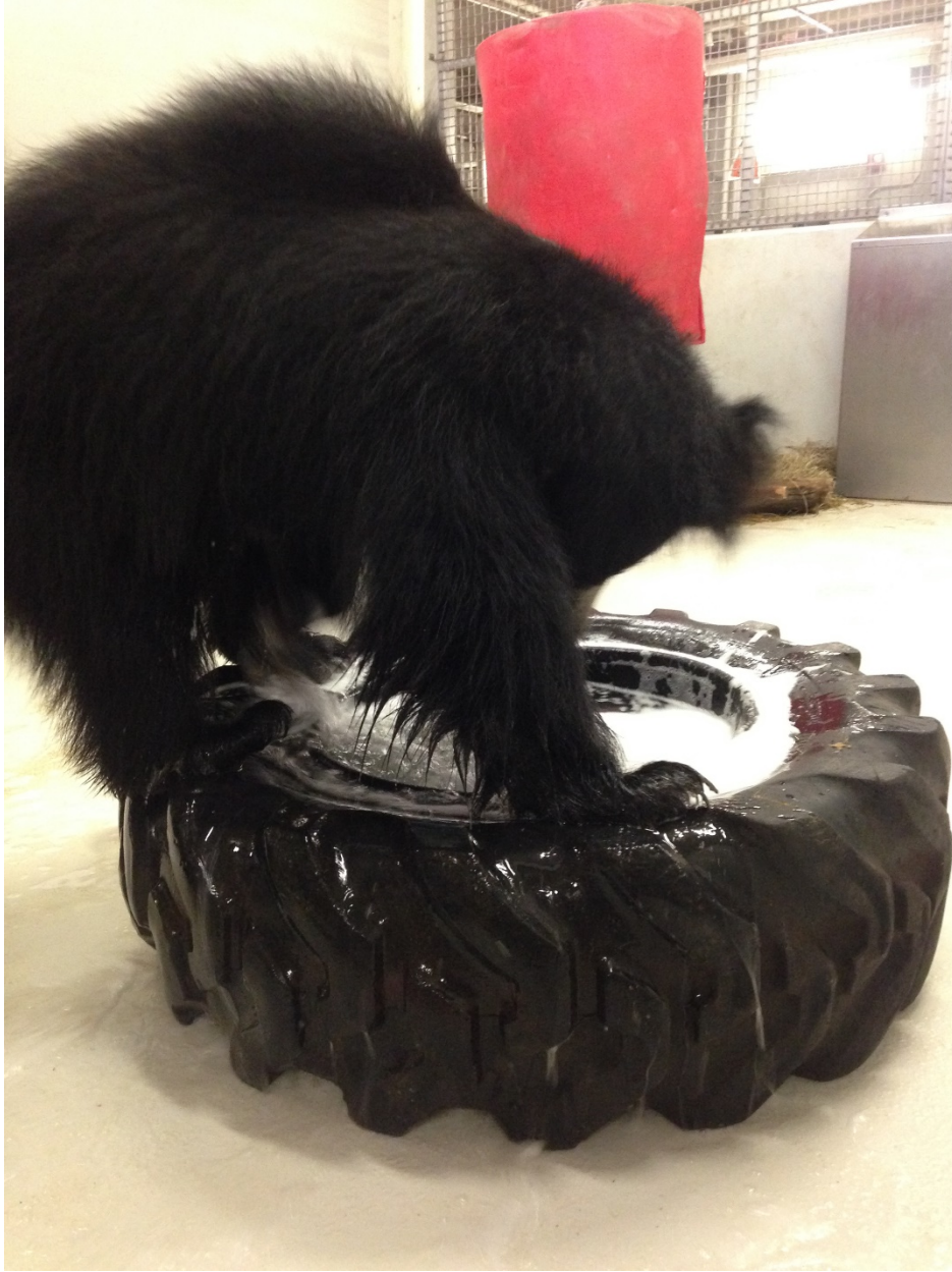
Bubble bath in a tire! Rubber tub inside tire filled w/ water & non-toxic bubble bath.

Smithsonian National Zoological Park; M. Babitz