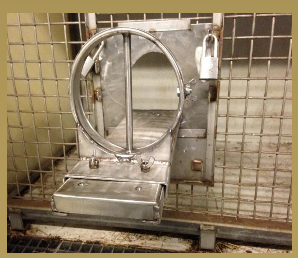
Sloth bear-Smithsonian National Zoo