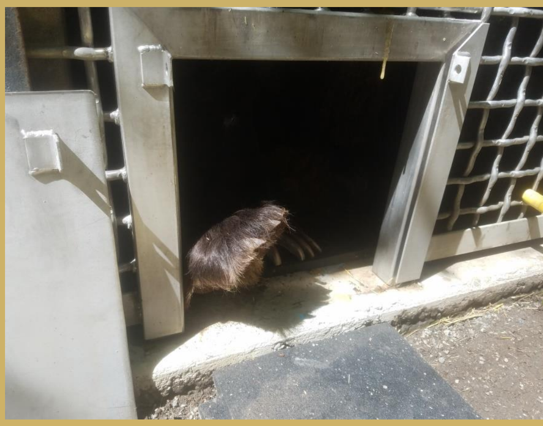
Brown bear-Northwest Trek

Commonly used methods of collecting blood from bears are: • The blood sleeve (used to access the cephalic vein on the foreleg)