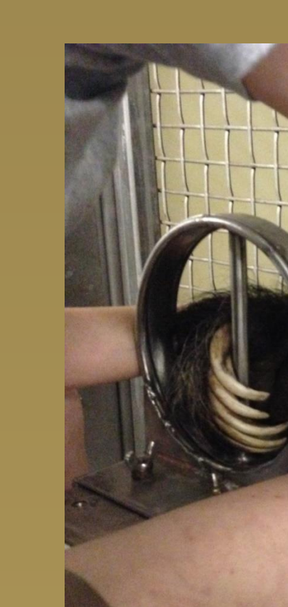
Sloth bear-Smithsonian National Zoo