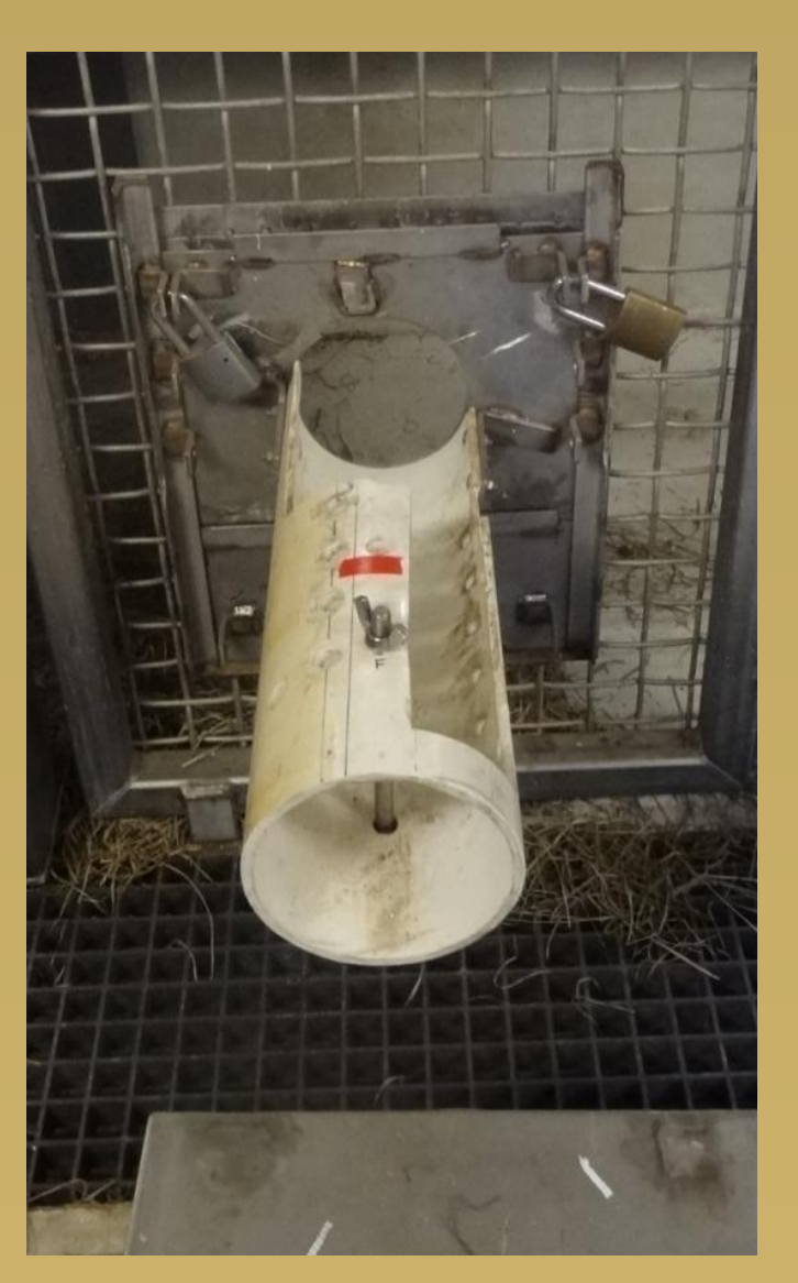
Sloth bear-Smithsonian National Zoo