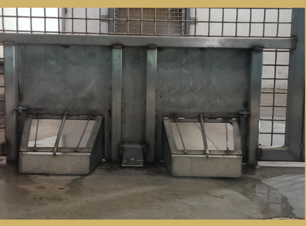
Polar bear-Como Zoo