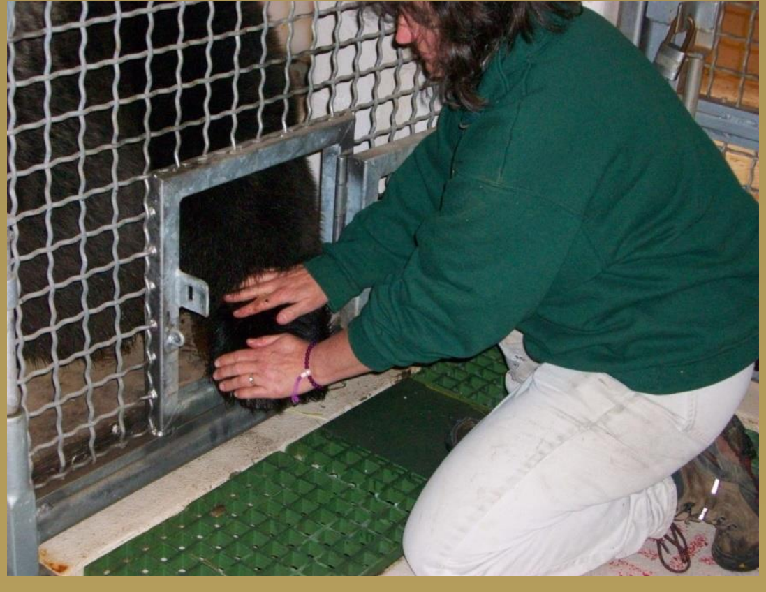
Brown bear-Woodland Park Zoo